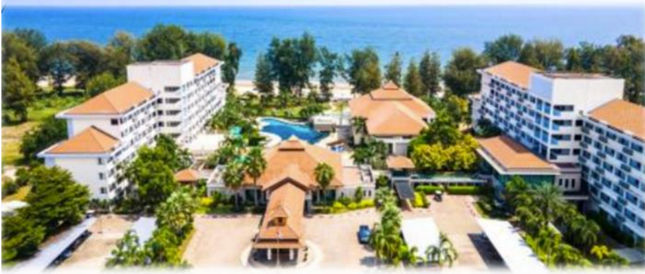
SEAPINE WING (สวนสน 2)