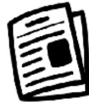
Year 5 Newsletter