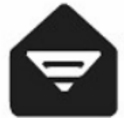
Year 5 Parent Communication